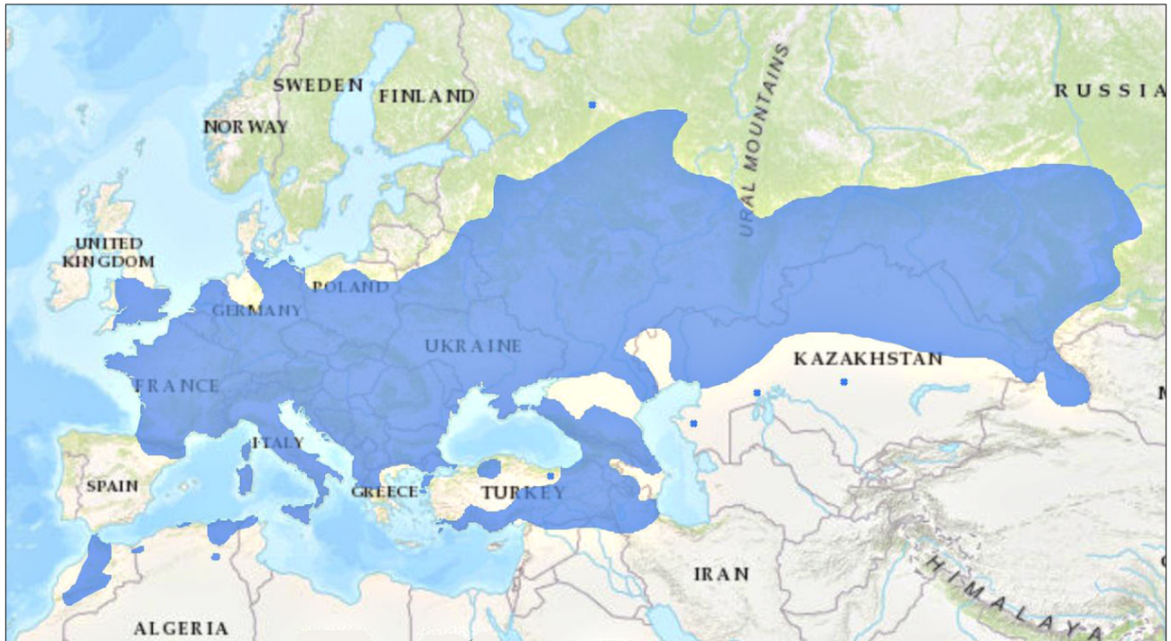
Fig. S1 – Map of the natural distribution of Populus nigra L..