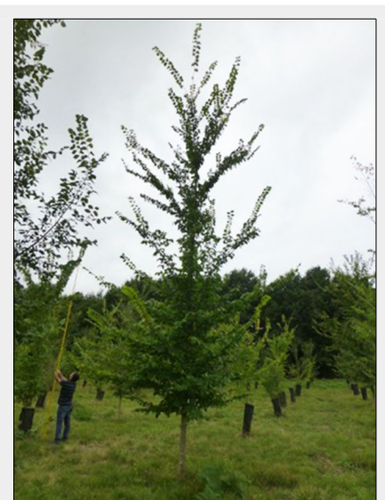
Fig. 2 - Experimental elm plantation of Saint-Herblain, near Nantes, Loire-Atlantique (Photo: Irstea E. Collin, 2016).

continued at Guémené-Penfao in partnership with the Italian RESGEN-78 project team, while experimental plantations (field hedgerows or monospecific plots) were established with numerous partners, mainly in western France. In both hedges and plots, the elms were planted at least five metres apart (Fig. 2), experimental protocol ensuring an equal distribution of clones throughout the plantation, at least five ramets per clone in hedges, and ten in the plots. In the earliest trial (Fig. 3b), 75% of the field elms studied were already contaminated by DED, which makes it possible to evaluate their reaction: death, recurrence of symptoms or remission. The other plantations (Fig. 3a and Fig. 3c) were less affected but provide more information each year. The data collected in the artificial inoculation tests and in the plantations enabled IRSTEA to select eight clones of field elm, including six French and two others, which were made available to forest nurseries in 2017 (Tab. 2). However, uptake of this material by nurseries was very limited because it was not resistant enough to DED. Unlike resistant hybrid cultivars, the selected clones are elms with typical characteristics of the field elm (small leaves, corky twigs). These clones show only moderate and unstable resistance to DED, with