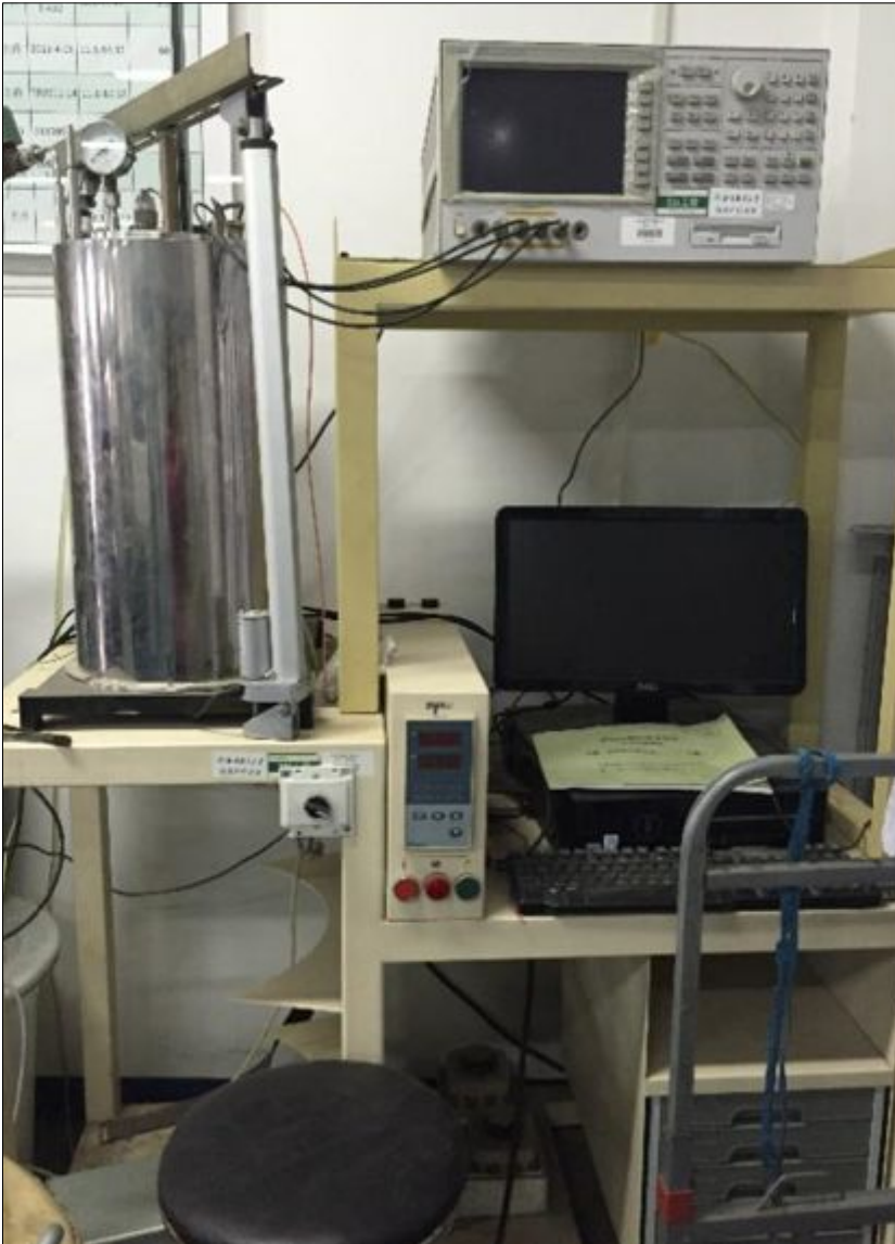
Fig. S1 - Image of dielectric testing machine.