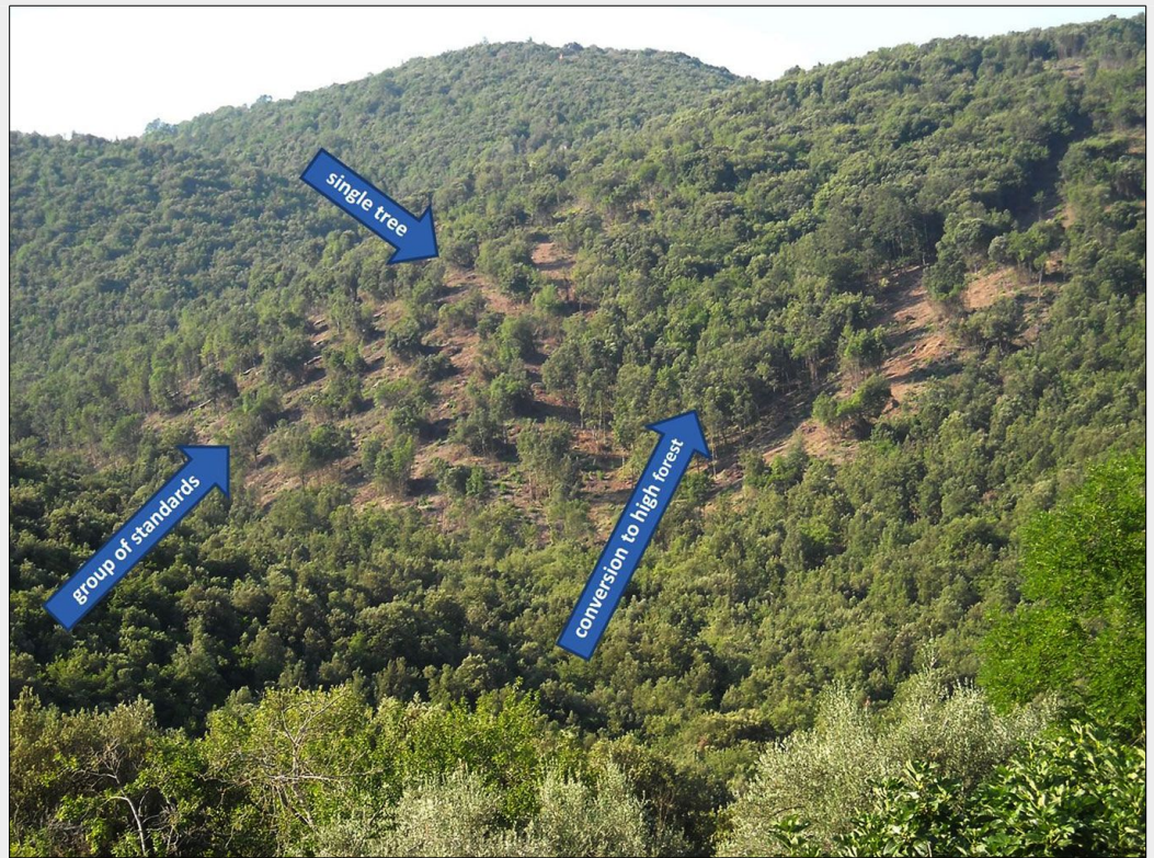
Fig. 3 - Example of the implementation of different silvicultural options at the stand level.

cate that progress is being made in this direction.