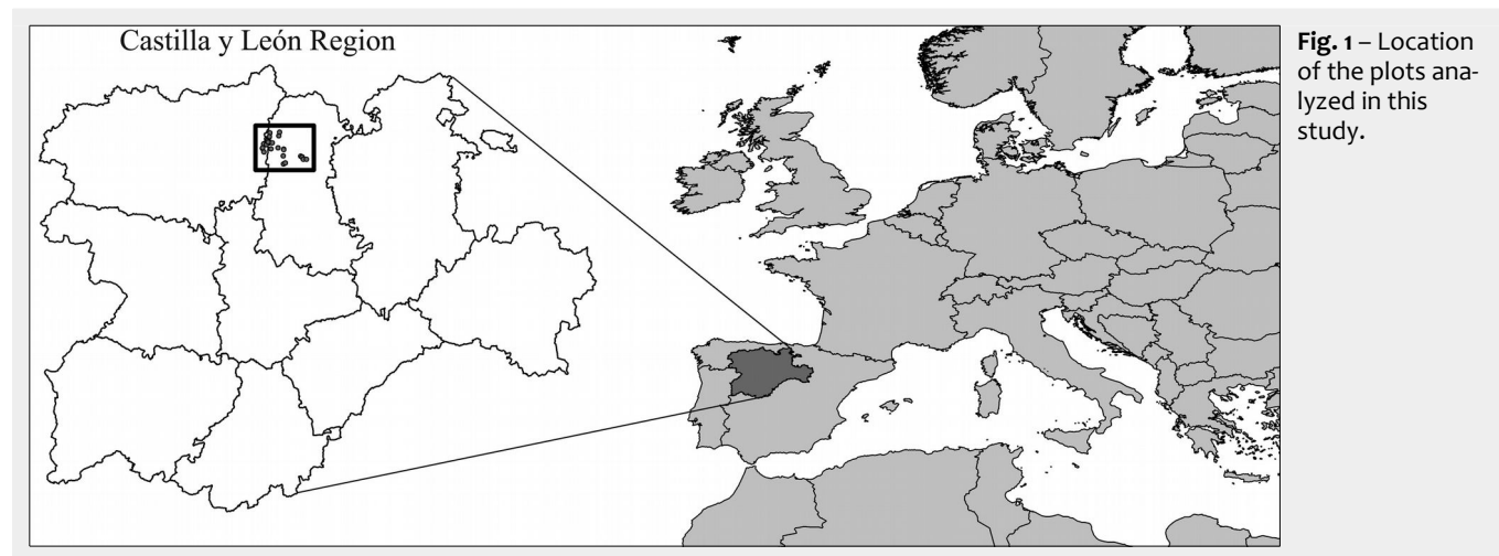
Fig. 1 – Location of the plots analyzed in this study.

the best predictors for forest productivity in Flanders, while Sharma et al. (2012) included several physiographic factors (latitude, aspect, slope) as well as soil depth, year of stand origin and sum of temperatures in their equations to predict site index for Scots pine in Norway. A discriminant model developed by Bravo-Oviedo & Montero (2005) for Pinus pinea L. in southeastern Spain also included textural parameters and, together with altitude, correctly classified 75% of the plots into their site index classes. Bravo et al. (2011) developed a discriminant model for Pinus pinea in Calabria (Italy) which correctly classified 61% of the stands using only two predictor variables: clay content and slope. Consequently, textural parameters (as well as physiographic parameters such as slope, latitude or altitude) are often included in site index models (Bravo & Montero 2001, Bravo-Oviedo et al. 2011, Aertsen et al. 2012, Sewerniak & Piernik 2012, Sharma et al. 2012).