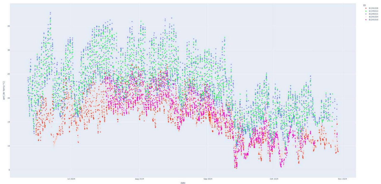
Fig. S1 - Main output from preliminary results of monitoring activities. Air Temperature (°C).

Hearing nature's heartbeat: towards large-scale real-time forest monitoring network in Italy iForest – Biogeosciences and Forestry – doi: 10.3832/ifor4830-018