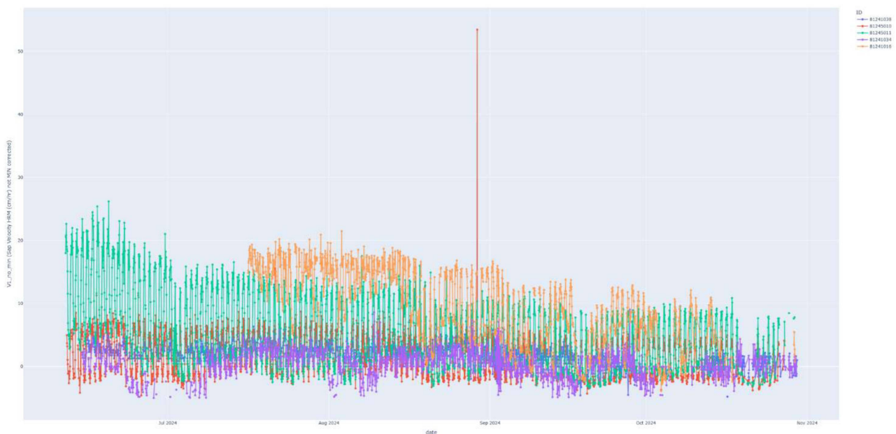
Fig. S4 - Main output from preliminary results of monitoring activities. Sap velocity ( \text{cm hr}^{-1} ).

Hearing nature's heartbeat: towards large-scale real-time forest monitoring network in Italy iForest – Biogeosciences and Forestry – doi: 10.3832/ifor4830-018