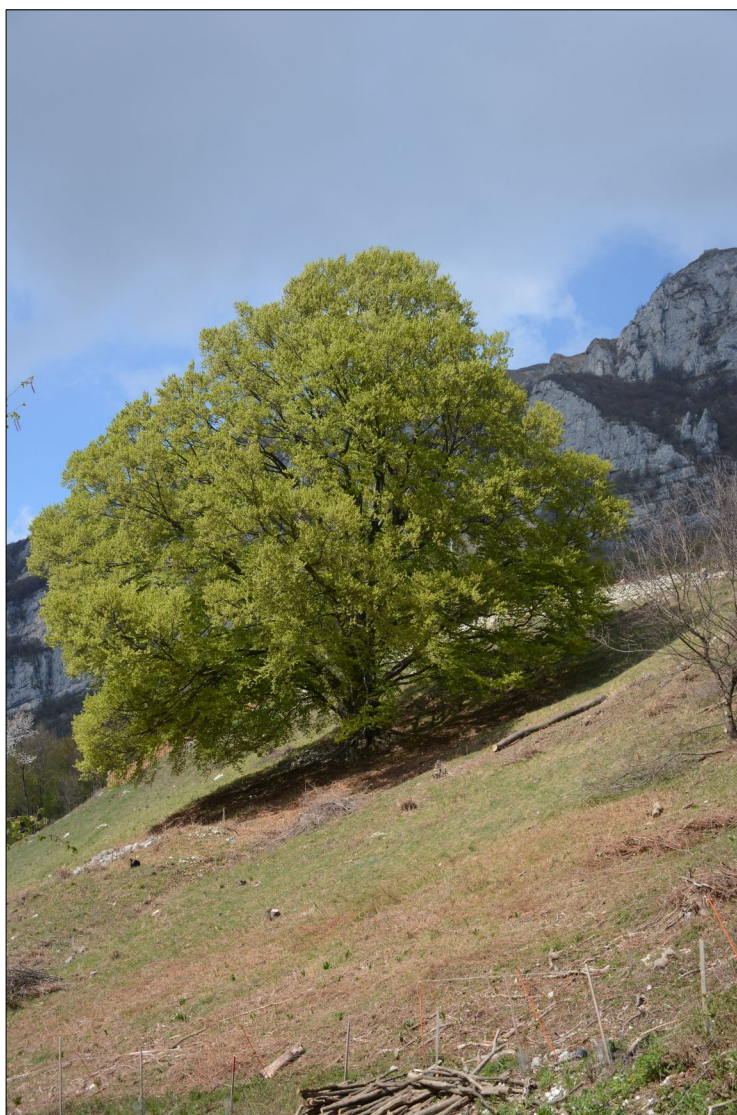
Fig. S1 – Veteran beeches are keystones of the Trentino landscape.