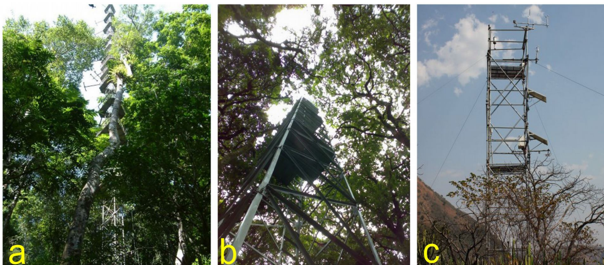
Fig. S1 - Observational towers in the tropical rainforest (TRF) (a), the subtropical evergreen forest (STF) (b) and the savanna forest (SAF)(c).