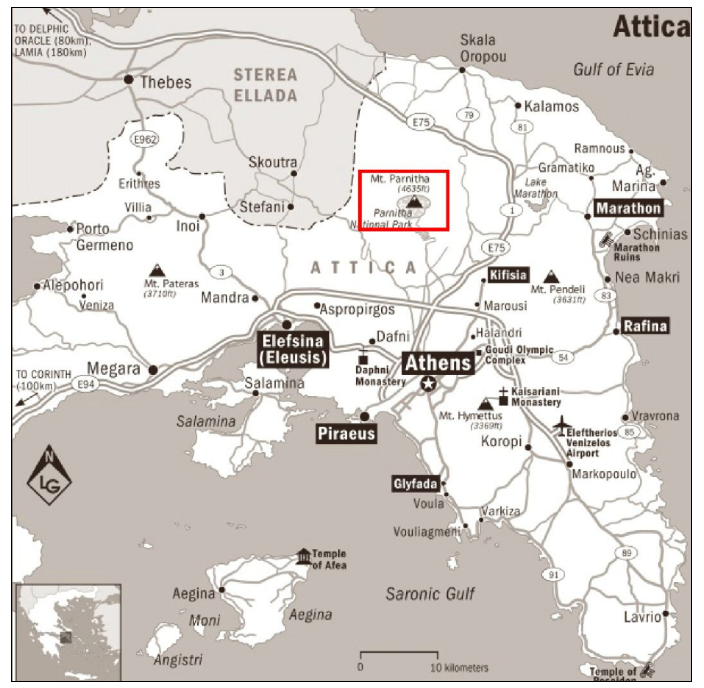
Fig. 1 - Map showing the study area (red box) at the Mt. Parnitha National Park, Greece.

A. cephalonica forests of Parnitha National Park, central Greece. The specific objectives of the study were: (i) to achieve knowledge for the regeneration potential of the species in the area, which is considered a key element in assessing the ability of physical resettlement of the forest; (ii) the evaluation of the early post-fire behavior of the burned fir stands; and (iii) the estimation of the plantings performance in the burned area. Then, based on the analysis results, an evaluation of the post-fire recovery process in the burned area was carried out. To this aim, a simplified form of the general comprehensive framework for ecological succession in open site developed by Pickett et al. (1987) was applied, adapted to the study conditions and focused on A. cephalonica, in order to make a provision for the future status of the burned fir stands.