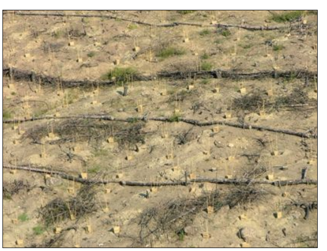
Fig. 3 - Plantings of A. cephalonica seedlings in the burned area of Parnitha National Park. Shading was achieved through the use of sacking in a triangular shape, based on 3 canes around the plant, of approximately 50 cm in height, while the sacking had a height of about 30 cm.

Assessment of the reproductive capacity of the A. cephalonica forest without the fire