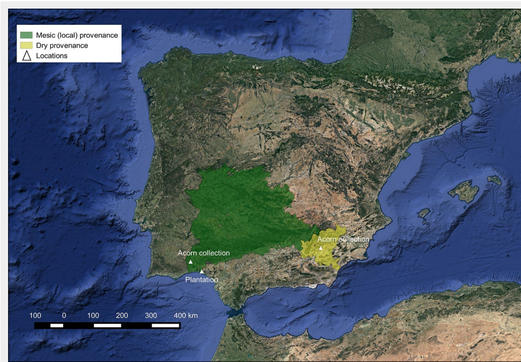
Fig. 1 - Map of the locations from which acorns were collected at each provenance (Acorn collection), and the location of the common garden in which seedlings were planted (Plantation). The shapefile of the different provenance regions was created by CIFOR-INIA (Madrid, Spain).

and following the method described by Scholander et al. (1965). E_c and RWC_c were evaluated in two mature leaves per sapling using the method of Quisenberry et al. (1982). Briefly, rehydrated leaves were placed abaxial surface down on a plastic mesh in a lighted laboratory at constant temperature (22 °C). The leaf fresh weights were measured at intervals of 5-10 minutes for a minimum of 7h. Afterwards, we calculated descending transpiration curves for each leaf, which were used to estimate E_c and RWC_c . The projected leaf area ( LA_p ) was measured in three mature leaves per sapling using ImageJ (different versions). SLA was calculated as the LA_p divided by the dry weight of leaves (oven-dried at 75 °C for 48h).