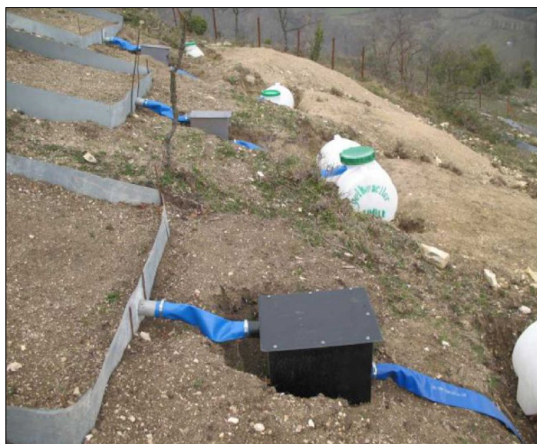
Fig. 2 - Storage system components: sedimentation box and runoff collection tank.

Total monthly rainfall amount was measured with a standard rain gauge located at