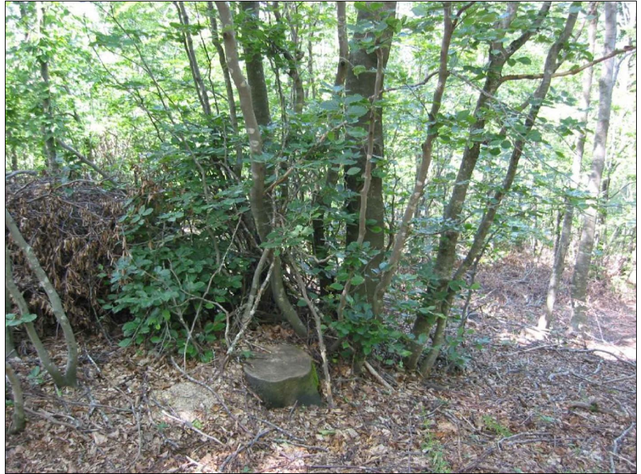
Fig. 3 - Beech selection coppice in the For-este Casentinesi, Monte Falterona and Campigna National Park.

caused by extensive fellings in the past century which practically excluded fir regeneration and favoured massive beech regeneration.