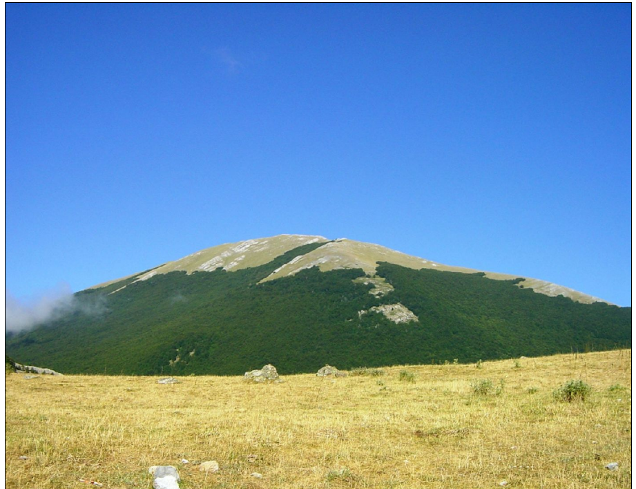
Fig. 2 - Permanent pastures have usually replaced the original beech forests in the higher areas of the Apennine mountain range, but sometimes beech stands still grow up to the mountain ridge, usually along valleys and over saddles (Pollino National Park).

definitive transformation of many beech forests into degraded pastures (Hofmann 1956, Susmel 1957). On the northern slopes and where there were better moisture conditions, beech regenerated massively both