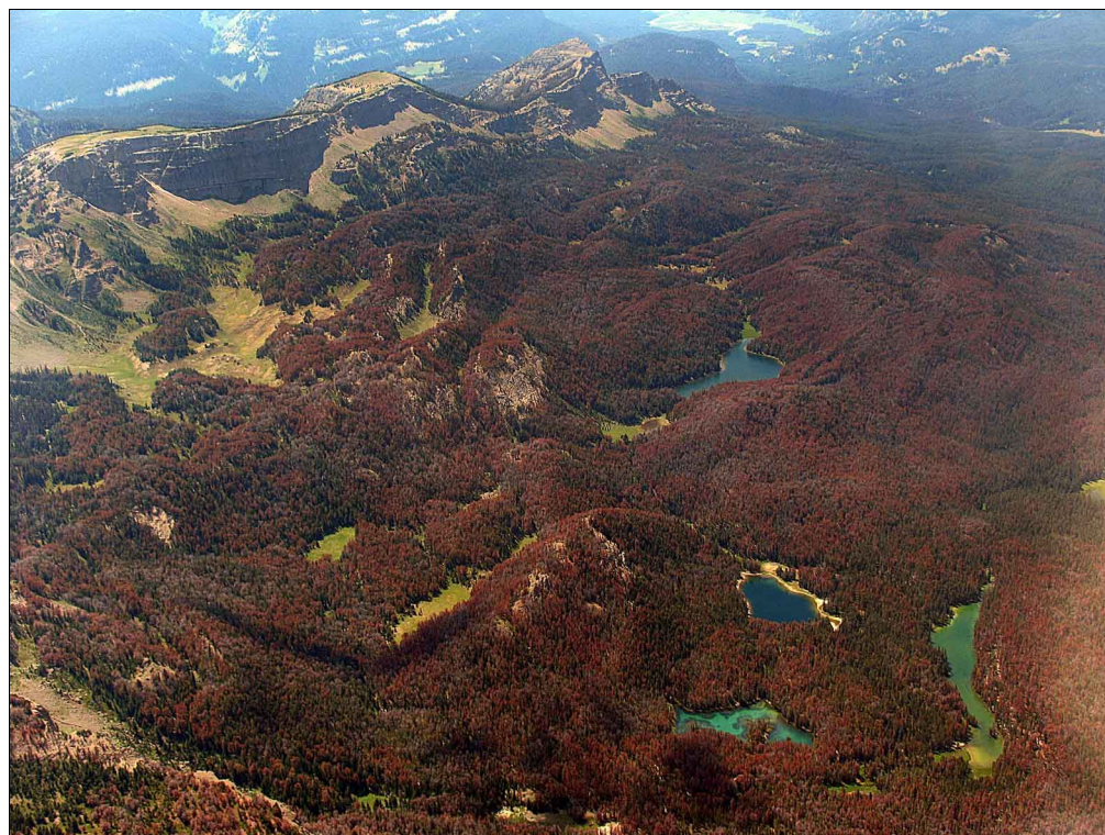
Fig. 1 - Mountain pine beetle mortality in whitebark pine. An example of the scale and intensity of mountain pine beetle mortality in whitebark pine of the Greater Yellowstone Ecosystem. This aerial photograph was taken by Jane Pargiter during the summer of 2007. The red trees were killed by mountain pine beetle during summer of 2006, the gray trees were killed the previous summer. The few remaining green trees are probably currently infested, and will turn red the summer of 2008.

available to the grizzly at a critical time - in the fall, just prior to entering hibernation. If female grizzlies enter hibernation when whitebark pine seed crops are poor, they produce fewer cubs. In addition, human-caused mortality rates greatly increase if whitebark pine crops fail, as grizzlies are driven to forage in lower-elevation areas where human conflicts become increasingly likely (Mattson et al. 1992, Gunther et al. 1997, Mattson 2000, Pease & Mattson 1999).