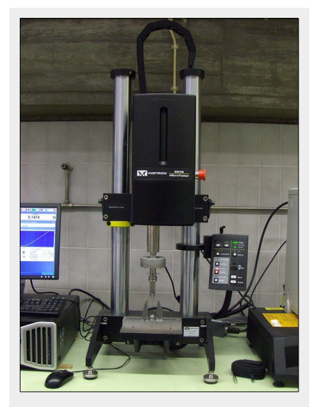
Fig. 3 - The Instron 5848 MicroTester machine used for the bending tests.

The mean values of wood-density components, and chemical and mechanical properties at each site are summarized in Tab. 2 and Tab. 3, respectively. The results of this study and previous findings from other studies and regions were compiled in Tab. 4 and Tab. 5 to facilitate their comparison and the discussion of results. Tab. 4 contains data concerning density components.