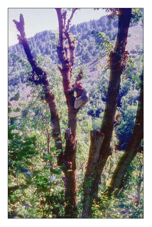
Fig. 1 - The shepherd climbing on an elm for destructive lopping.

Fig. 2 - Sustainable use of elm: the tree on the left has been lopped very carefully; the others will follow.