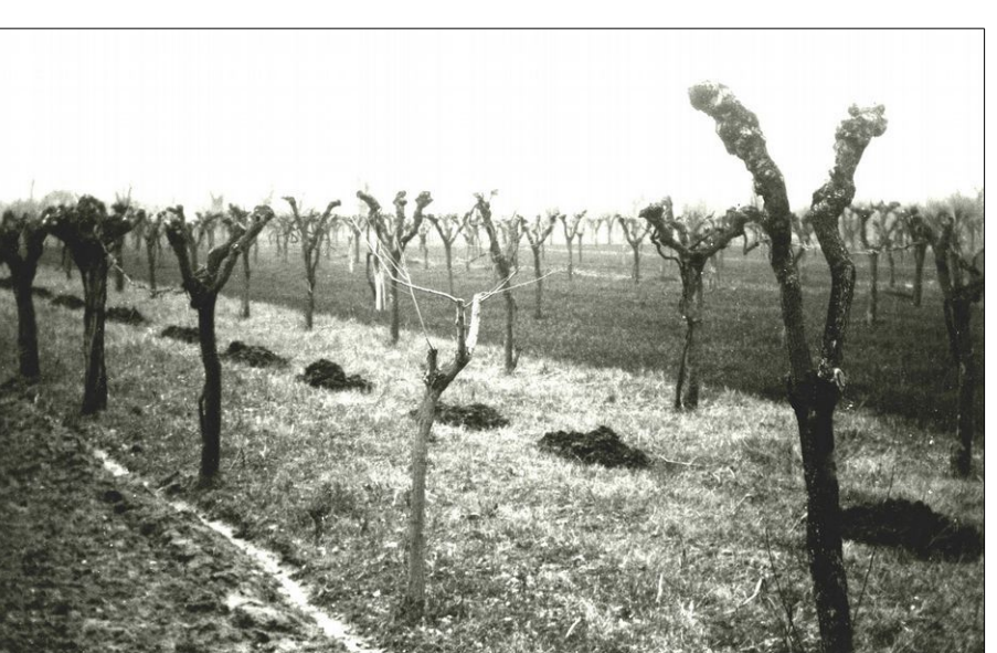
Fig. 7 - Coltura promiscua in Emilia: rows of lopped elms (one dead by DED) as props for the grapevine, heaps of manure for the field crops (lucerne for the cattle, and grain) between them (Photo: C. Buisman, 1935).

In addition to the ones mentioned, elm has had some other functions, but the most important one, from deep prehistory until recently, was the provision of fodder for the cattle, producing milk and associated products.