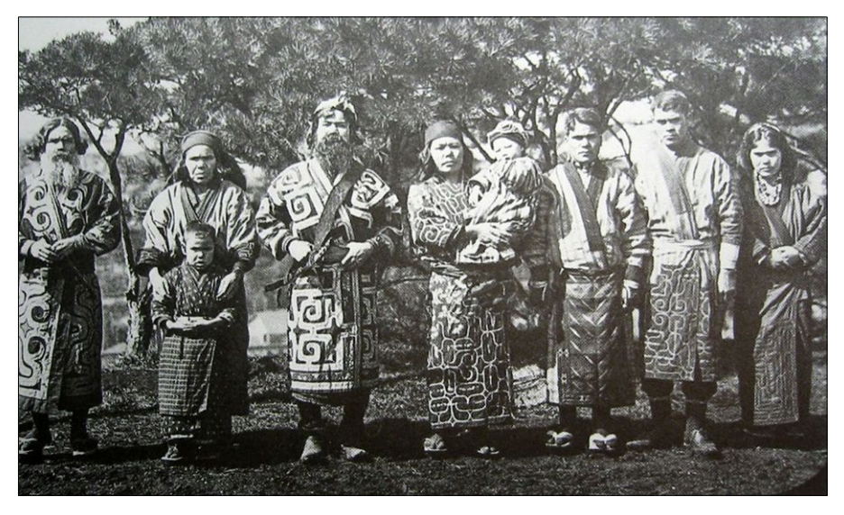
Fig. 4 - A group of Ainu people wearing the traditional dress made from elm bark.

Therefore, the elm has kept a female image up to recent times. The hollow elm at the garden restaurant of Kraantje Lek, near Haarlem (The Netherlands), as well as the old "Luther elm" near Worms (Germany), were reputed locally to be the places where