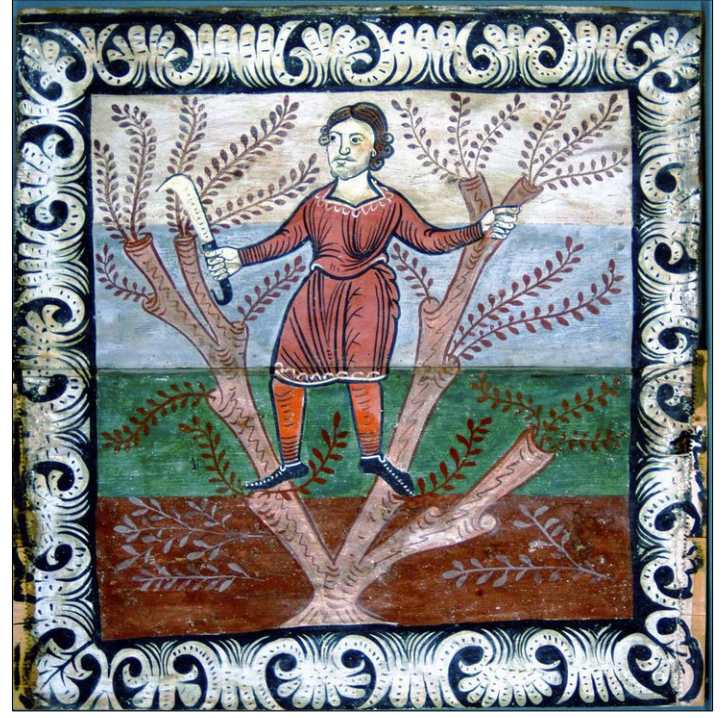
Fig. 3 - Lopping of elm in Switzerland (church in Zillis, Graubünden, ca. 1110).

In the old Germanic mythology, the first